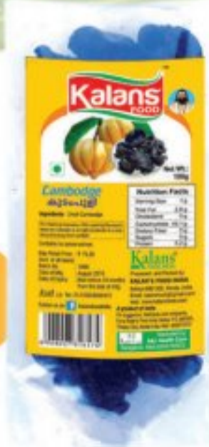
Cambodge (Kordampuli) 100 gms