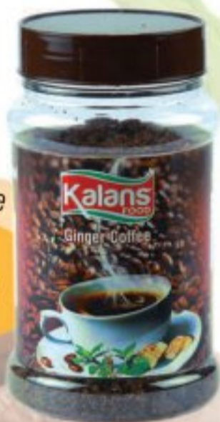
Ginger Coffee 150 gms