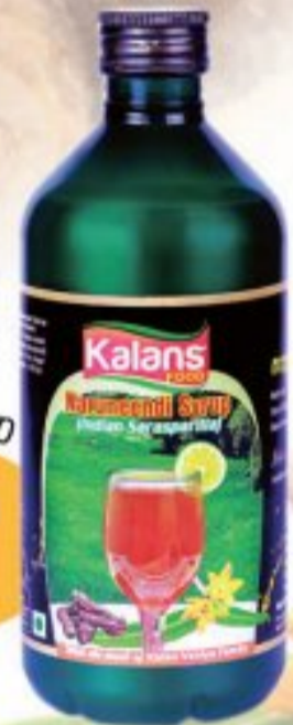
Nannendi Syrup 450 ml