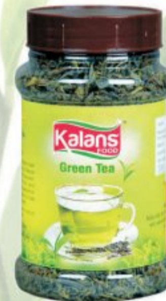
Green Tea 100 gms