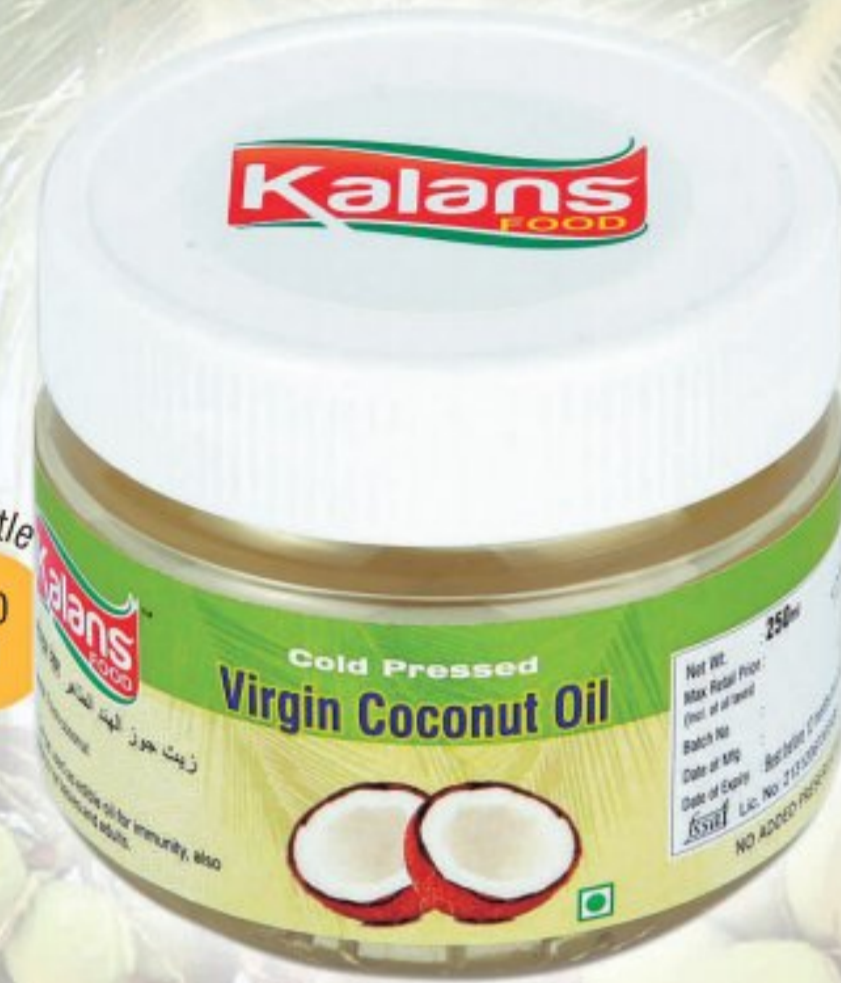
Glass Bottle 250 ml