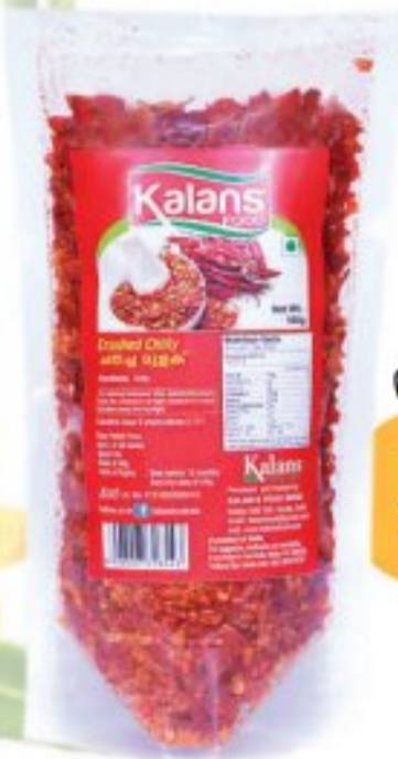
Crushed Chilly 100 gms