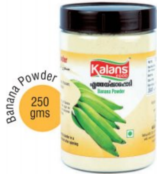
Banana Powder 250 gms