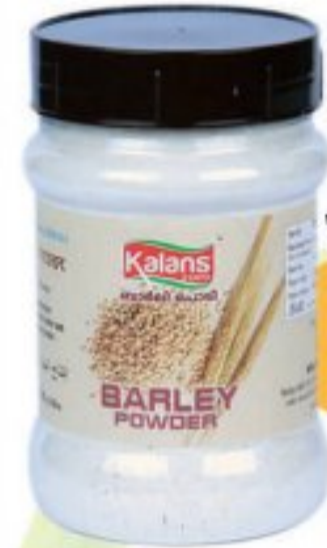
Barley Powder 100 gms