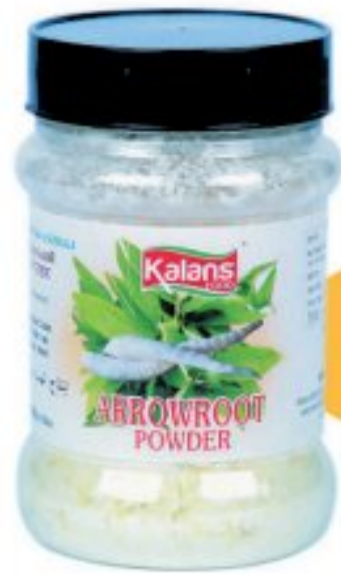
Arrowroot Powder 100 gms