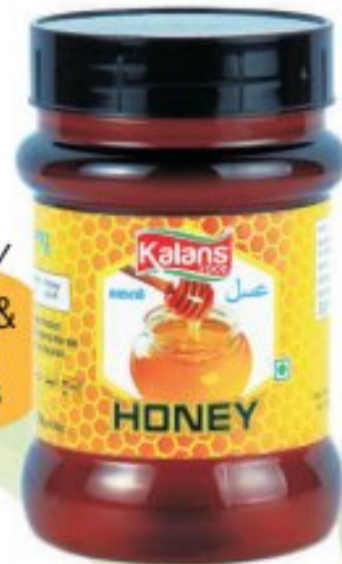
Honey 100 & 250 gms