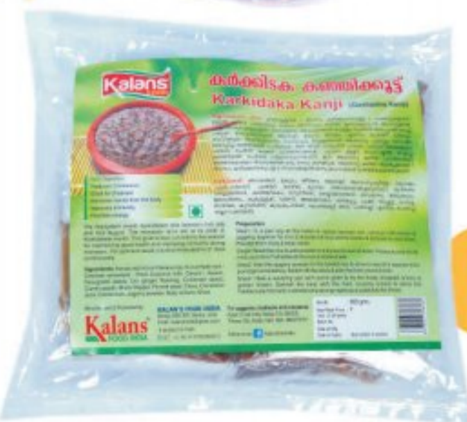
Karkidaka Karji 700 gms